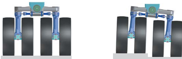
Even weight distribution on each tyre.