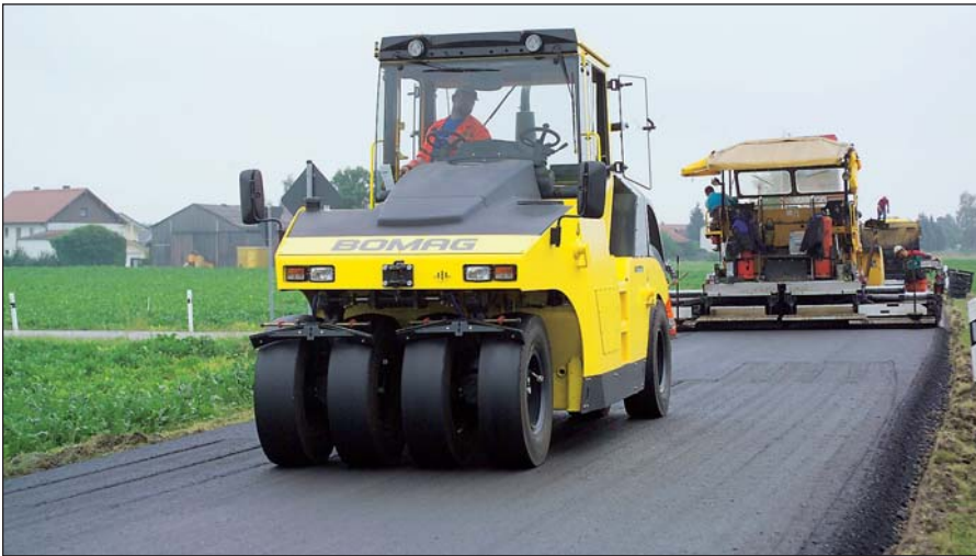
The BW 24 RH and BW 27 RH are flexible pneumatic tyred rollers for compaction work in asphalt and earthworks.

The pneumatic tyred rollers are driven using gas pedal and brakes as in conventional cars. The hydrostatic drive also gives highly sensitive control when manoeuvring. This is important for smooth reversing. However, the system also sets new standards with regard to safety: e.g. by using the dynamic service brakes. These are maintenance-free, heavy-duty and supplement the hydrostatic brake effect.