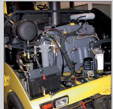
Easy and quick to service: The engine is easily accessible from all sides.