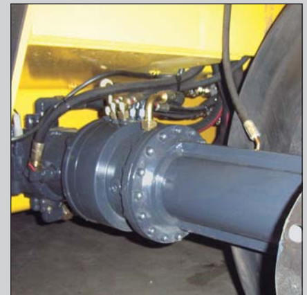
Sensitive speed control using a hydrostatic drive.