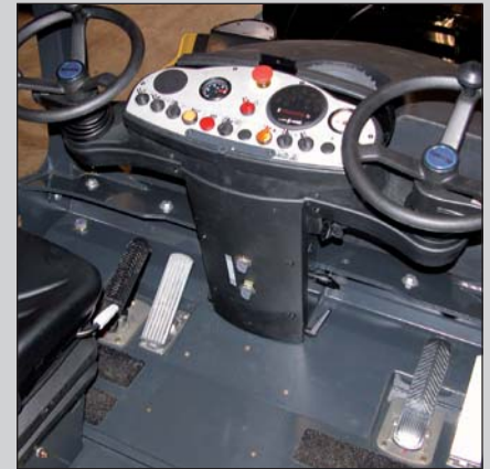
Two complete operator platforms with swivel/sliding seat make work more efficient and give good visibility.

Pneumatic tyred rollers achieve a high level of compaction quality from the kneading and rolling effect of the wheels. Highly uniform compaction is produced which also gives a dense finish at the surface. The heavy weight of the rollers (up to 27 t) generates a vertical pressure combined with horizontal forces acting in all directions beneath the tyres.