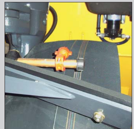
Standard equipment: pressurized sprinkling produces even wetting – regardless of gradients or water tank level.

The BW 24 RH and BW 27 RH BOMAG rollers can be adjusted to provide the specified weight for the job. To achieve this, different ballasting options are available. The rollers can be pre-ballasted with individual weights (attached under the frame). The large ballast space (approx. 3.5 m 3 ) is usually filled with sand or steel scrap for flexible weight adjustment. With the watertight, welded frame option, the rollers can also be ballasted with water.